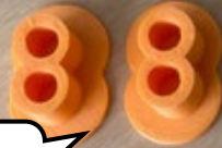
Stands (or use playdough)